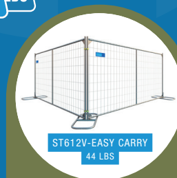
ST612V-EASY CARRY 44 LBS