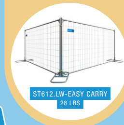
ST612.LW-EASY CARRY 28 LBS