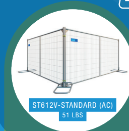
ST612V-STANDARD (AC) 51 LBS