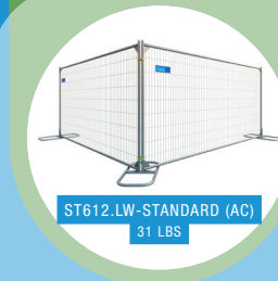
ST612.LW-STANDARD (AC) 31 LBS

The wider aperture makes the ZND panel easier to handle